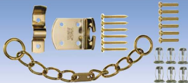
TIMBER/PVCU DOOR CHAIN